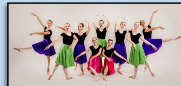
Youth Ballet Light of the World Ballet