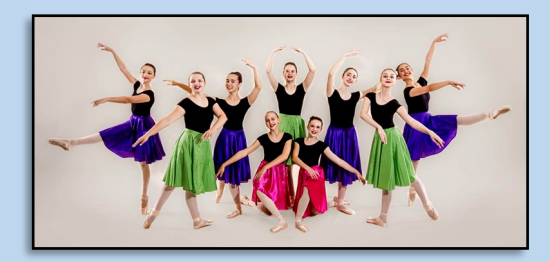
Youth Ballet Light of the World Ballet